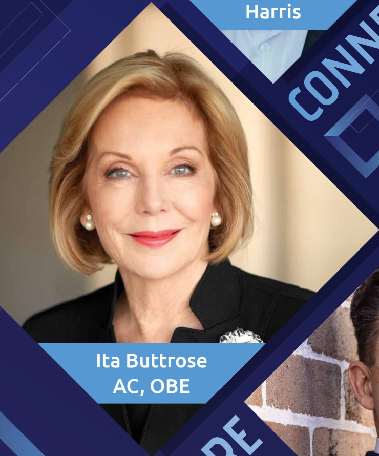
Ita Buttrose AC, OBE